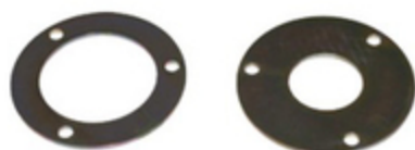
ADATTATORI STANDARD STANDARD ADAPTERS